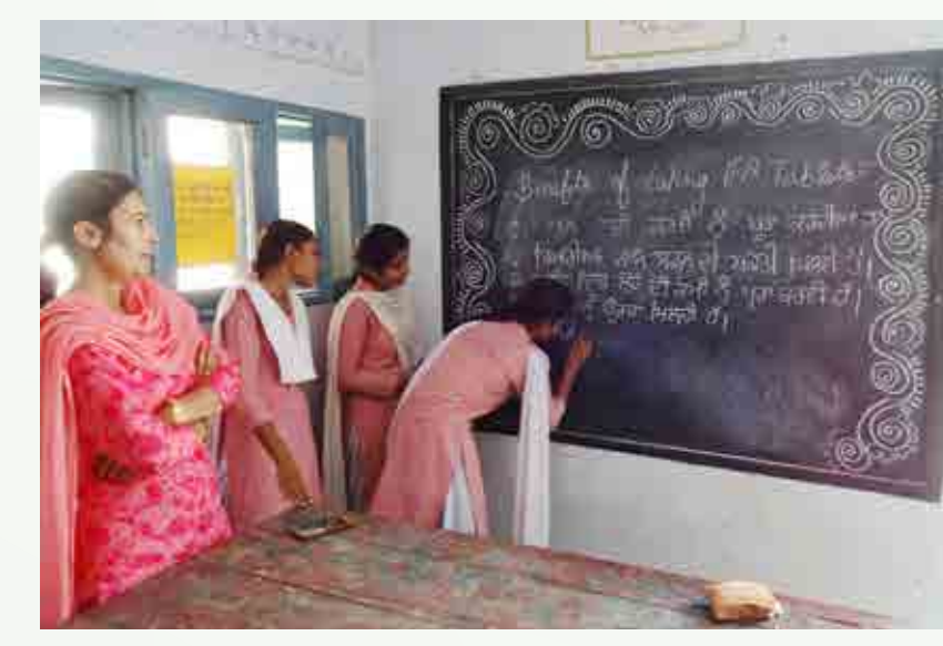
NHED Session at schools