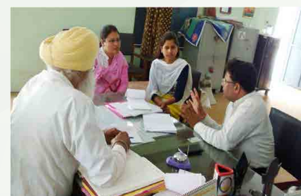
Orientation to Cluster principal and nodal teachers regarding SOP