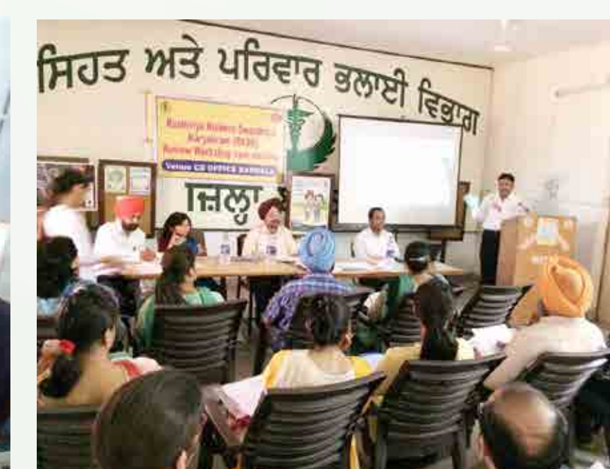
WIFS Convergence Meeting