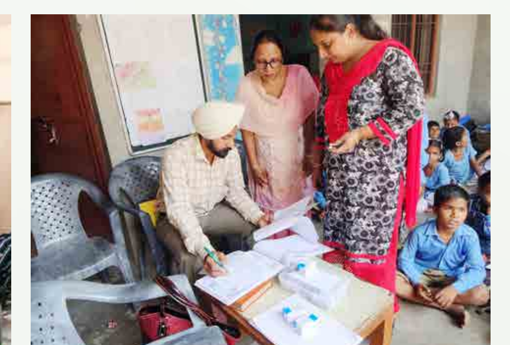
DPM, Barnala conducting Supportive supervision